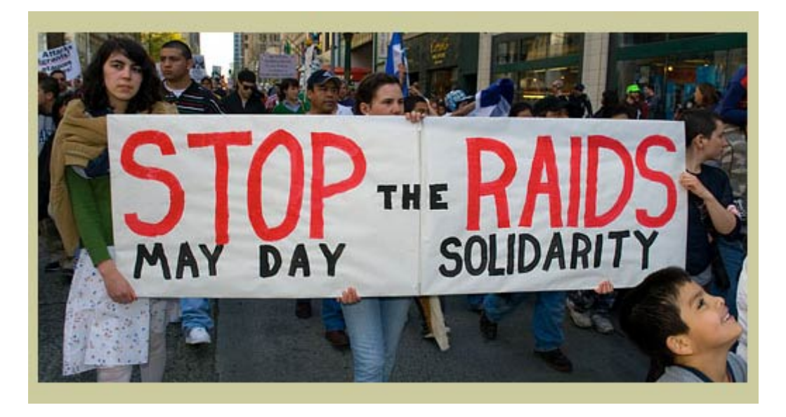
On May Day, several thousand demonstrators marched through downtown Seattle to advocate for immigration reform and to protest deportations.

http://seattle.indymedia.org/en/2008/05/266377.shtml